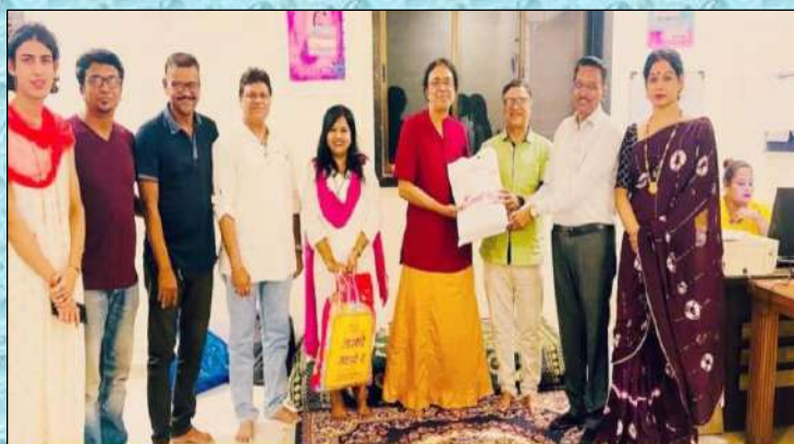
Celebrating Diwali with Transgender People

The Rotary Club of Panvel Mahanagar recently celebrated Diwali, in a unique way. As part of a synergy project, the club provided sarees and other festive items to transgender people in the local community. This initiative was a powerful demonstration of the club's commitment to inclusivity and social justice.